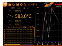
The Table View showing Instantaneous, Valley, Average and Peak, plus the unique Meltmaster temperature (on the 055L model) readings.

The Trend View displays Peak, Instantaneous, Average and Valley temperatures, Logger settings, Route Manager, Background Correction plus Timed Logging (taking measurements at pre-defined intervals between 1 and 60 secs).