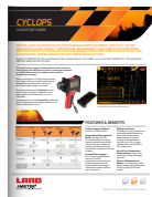
CYCLOPS LOGGER SOFTWARE

SEE OUR OTHER RELATED LITERATURE FOR THE CYCLOPS L: